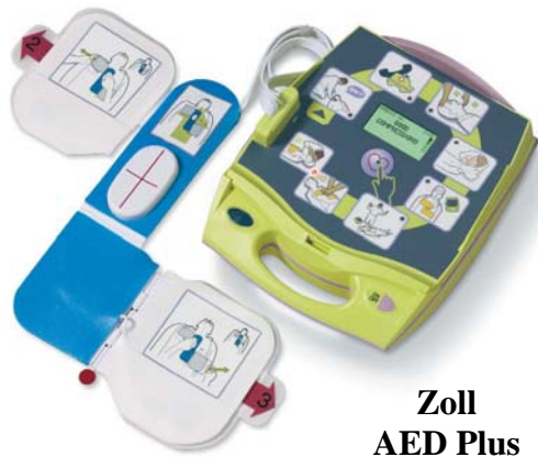
Zoll AED Plus