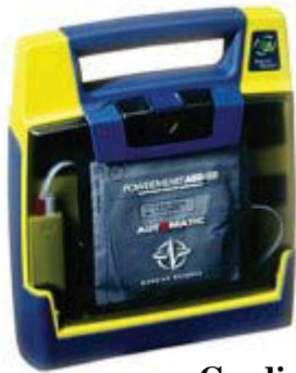
Cardiac Science G3PLUS

In the past year, approximately 250,000 Americans died of sudden cardiac arrest: nearly one death every two minutes. Up to 100,000 of these deaths could have been prevented if someone had initiated the Cardiac Chain of Survival and an automated external defibrillator (AED) had been available for immediate use at the time of the emergency.